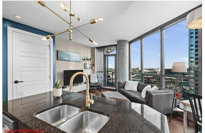
View of Saddle Dome

This unit is well taken care of as previously was purchased from the owner that lived there