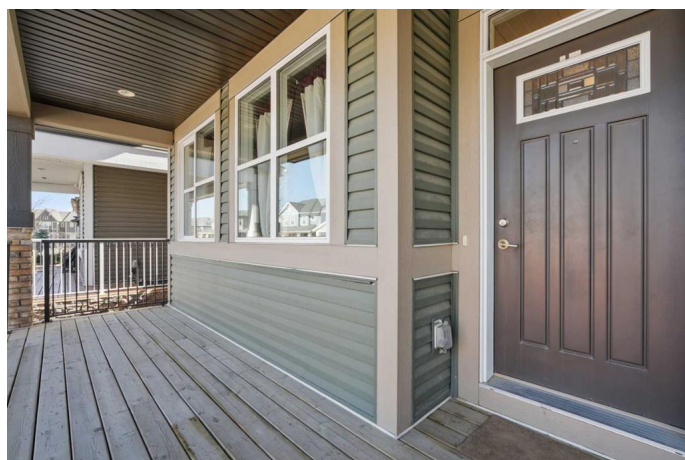
41 Legacy Glen Row SE, Calgary, AB